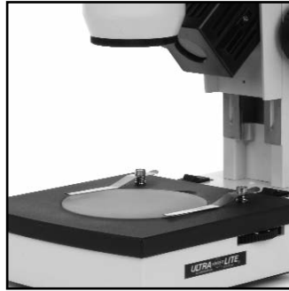
Extra large stage allows ample room for viewing specimen