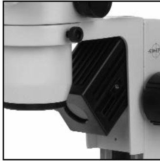
Adjustable light path assures optimal lighting of specimen